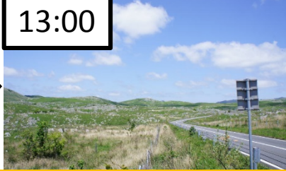
Akiyoshidai Karst Road